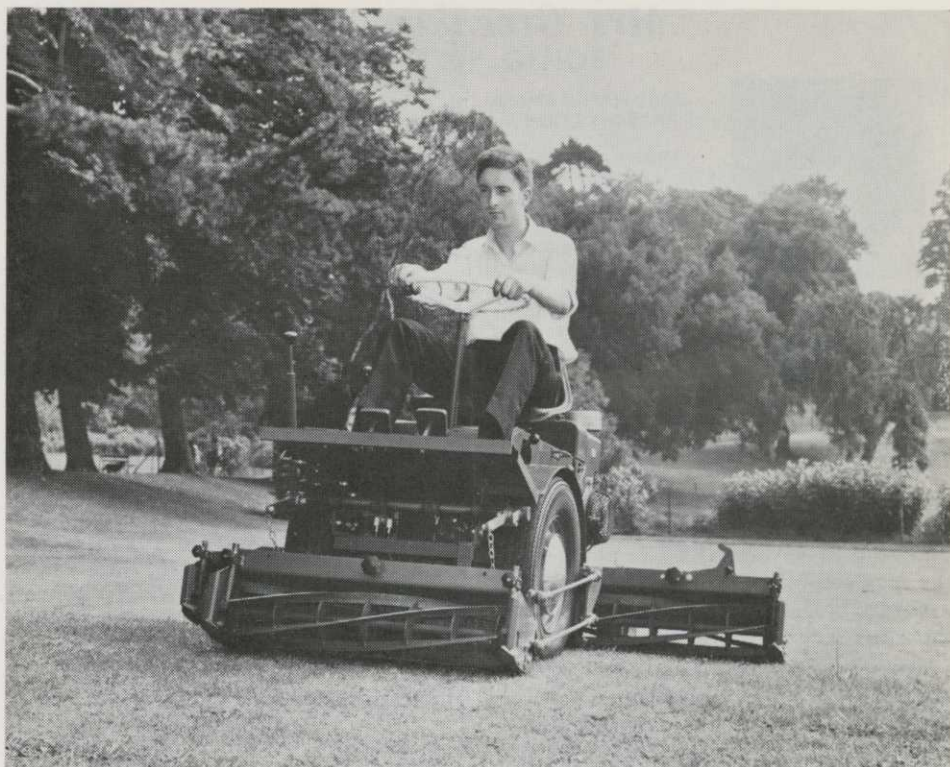
The new JUNIOR MOTOR TRIPLE from Ransomes with three power driven units cutting 73" wide and up to 1¼ acres an hour.