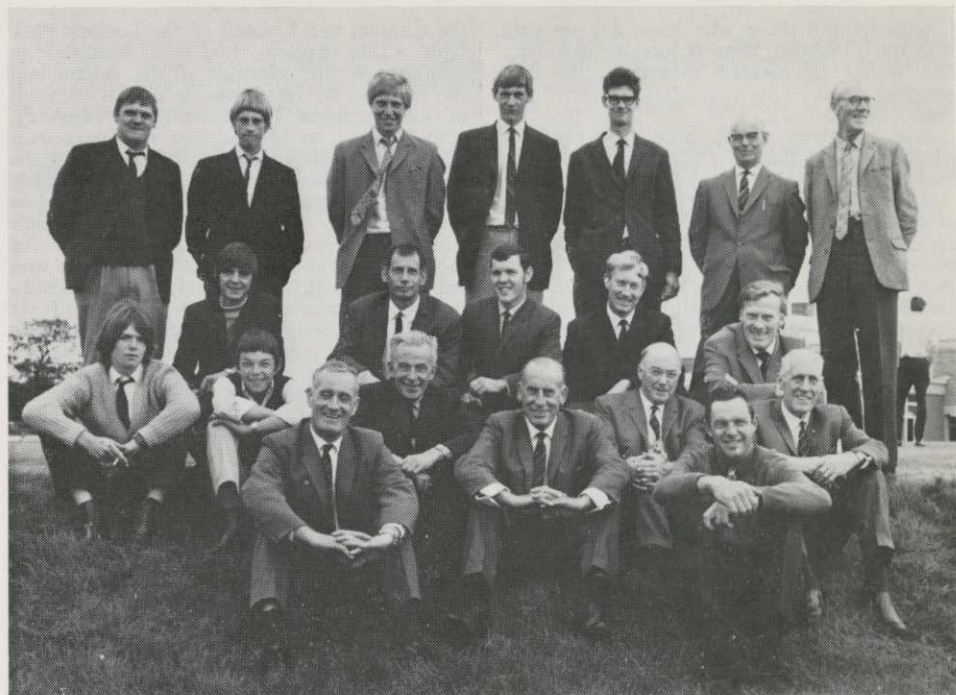
Southern Section party visiting ATCO works in Birmingham, 25th September 1969. Taken at the Robin Hood Golf Club, Solihull.