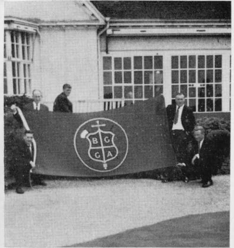
A group of members displaying the new Association Flag.