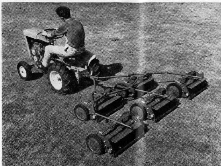
The Ransomes Junior Quintuple Gang Mower pulled by an International Harvester Cub Tractor. This tractor is also useful for pulling golf ball harvesters on Driving Ranges.