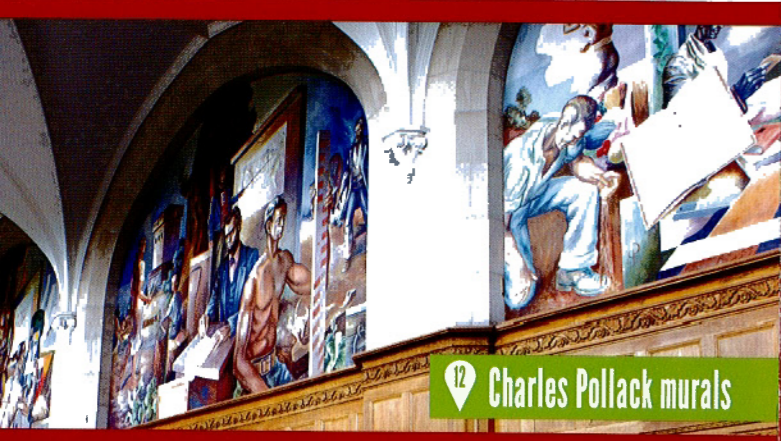
Charles Pollack murals