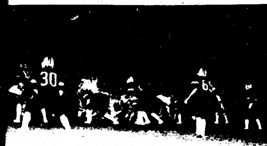
The Dutch Defense holds Grass Lake.