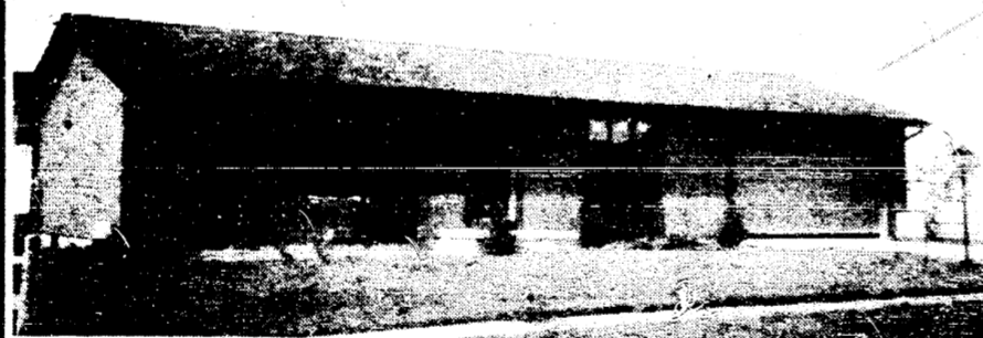
1513 SOUTHWICK TECUMSEH

1,299 Sq. Ft. of living space for $74,120. Full basement, 2 car garage, 3 bedrooms, 2 baths, family room, fireplace, conversation room, garden window in kitchen nook, garbage disposal, Dura counter tops, Merrill cabinets, carpeting by Cabin Craft, and wood windows. Fully landscaped, concrete drive, 12x15 patio, gas heat, central air and well insulated. Cathedral ceilings and aluminum siding. Prices on this model start as low as $63,850.