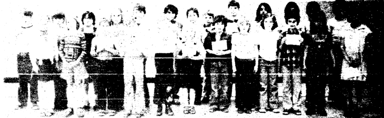
This group of young people from Klager School are wearing big smiles and they have every right to. They participated in a Read-A-Thon for Multiple Sclerosis.