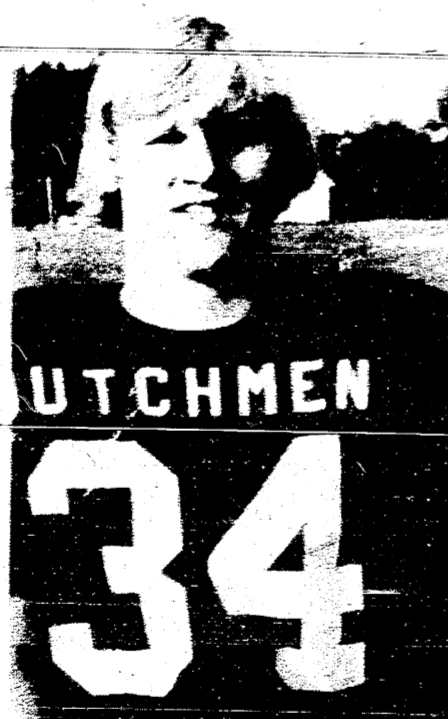
Best Offensive Player of the Week

Following the kick-off Grass Lake got moving somewhat then stalled and... accomplished little so... The Warriors started using the quarter-back option off right end successfully and... on the move, as they neared the... the three pass only to have it intercepted by Craig Rogers. The first quarter ended at 6:14. We wasted no time... down the field with Jim