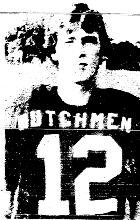
Best Defensive Player of the Week

...we've always have... with the Warriors of... it was this year... but the Dutch... have 12 men out this year... dressed with 2... This means some play... whole game without relief and all... I must say the Dutch... in there and... home the victory.