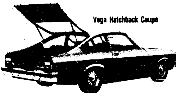
Vega Hatchback Coupe