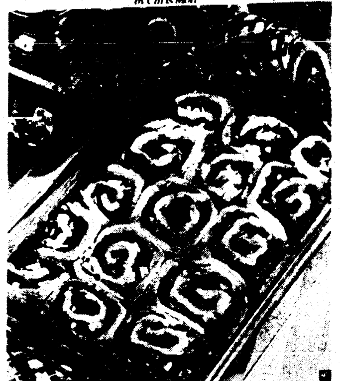
Apple-Mince Cobbler Swirls: A New Mince-meat Treat

If you only think of mince-meat once a year for that traditional mince pie, you're overlooking a versatile convenience food that adds taste appeal to a variety of recipes. Serve these Apple-Mince Cobbler Swirls warm from the oven for a dessert or decrease the mince-meat to a savory swirl for any savory recipe.