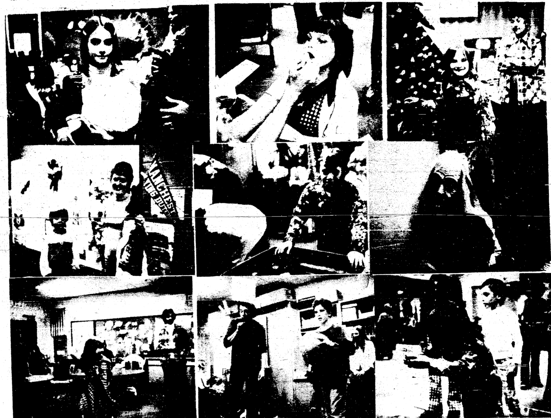
FALL FESTIVAL A GREAT SUCCESS

This year's Fall Fun Festival which was sponsored by the Pleasant Lake and Klager Schools was a very large success this past Saturday evening. The success is a result of much help from so many people.