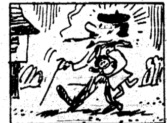
In 1919, Parisians carried dolls about with them to ward off influenza!

The couple spent two weeks touring upper and lower Michigan including several days at the Tulip Festival in Holland.