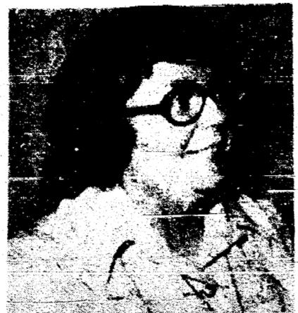
SUMMER YOUTH VOLUNTEER DIRECTOR FOR METHODIST HOME ANNOUNCED