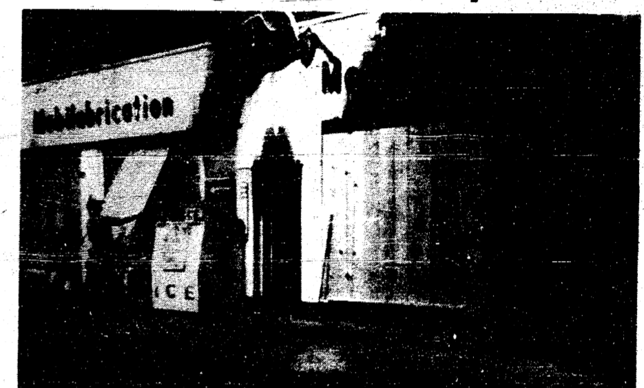
At 10 p.m. Sunday, September 17, lightning struck Spike's Mobile Service causing extensive damage to the interior. Spike said he would be pumping gas just as soon as the electrical hook-up to the gas pumps could be made. He expects to be back in full operation some time next week.