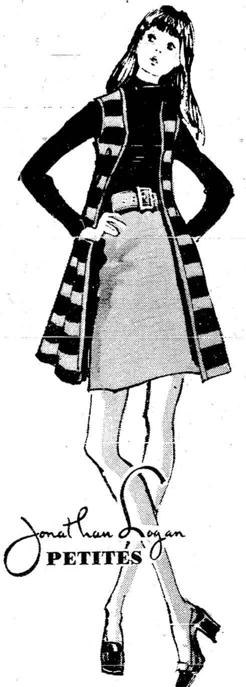
Jonathan Logan PETITES