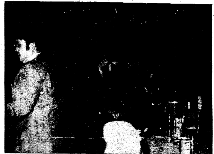
The "Soda" Bar.