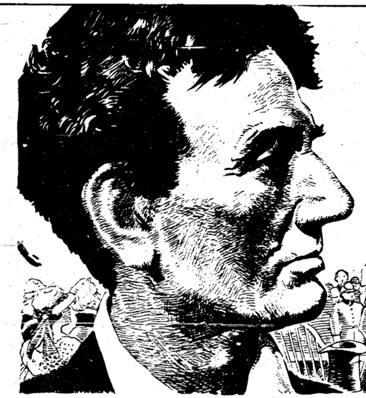
ABRAHAM LINCOLN WALKS AT MIDNIGHT

Vachel Lindsay It is portentous, and a thing of state There here at midnight, in our little town A mourning figure walks, and will not rest, Near the old courthouse pacing up and down. Or by his homestead, or in shadowed yards He lingers where his children used to play, Or through the market, on the well-worn stones He stalks until the dawn-stars burn away.