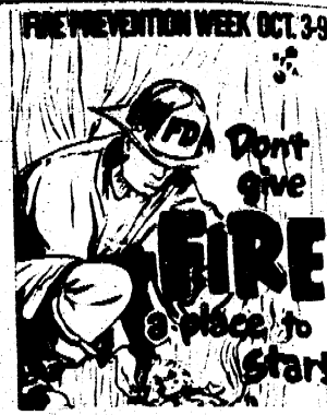
FIRE PREVENTION WEEK OCT. 30

Arbiter Society will meet at 8:00 p.m. Monday, October 4 at the Knights of Columbus hall.