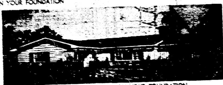
COMPLETE and ERECTED ON YOUR FOUNDATION