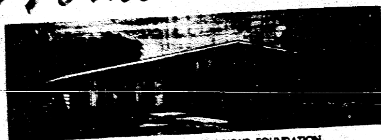
COMPLETE and ERECTED ON YOUR FOUNDATION