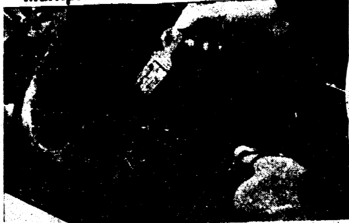
As seen in Better Homes & Gardens Magazine