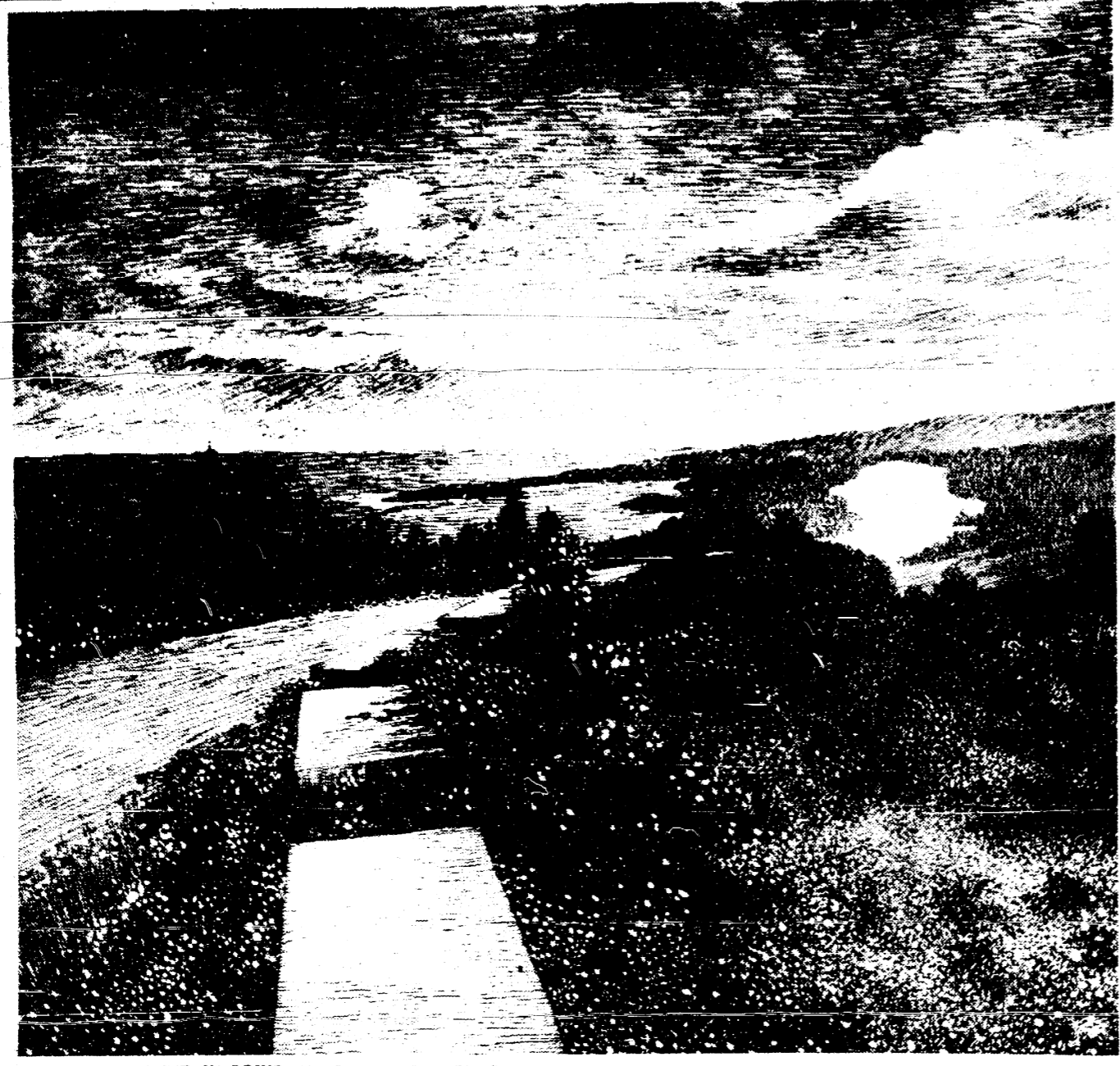
BROCKWAY MOUNTAIN DRIVE—NEAR COPPER HARBOR

An ideal power package for small garden plots, the 2 1/2 h.p. SCOTSMAN comes equipped with 23" Scotsman Mulching Rotors. Tills to 10" deep. Also recommended for use with Tined Rotors, 12" or 24" wide. Easily converts to tractor-adaptable to most draft tools and attachments. High-quality inner construction as on larger models.