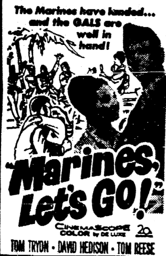
TOM TRYON - DAVID HEDISON - TOM REESE