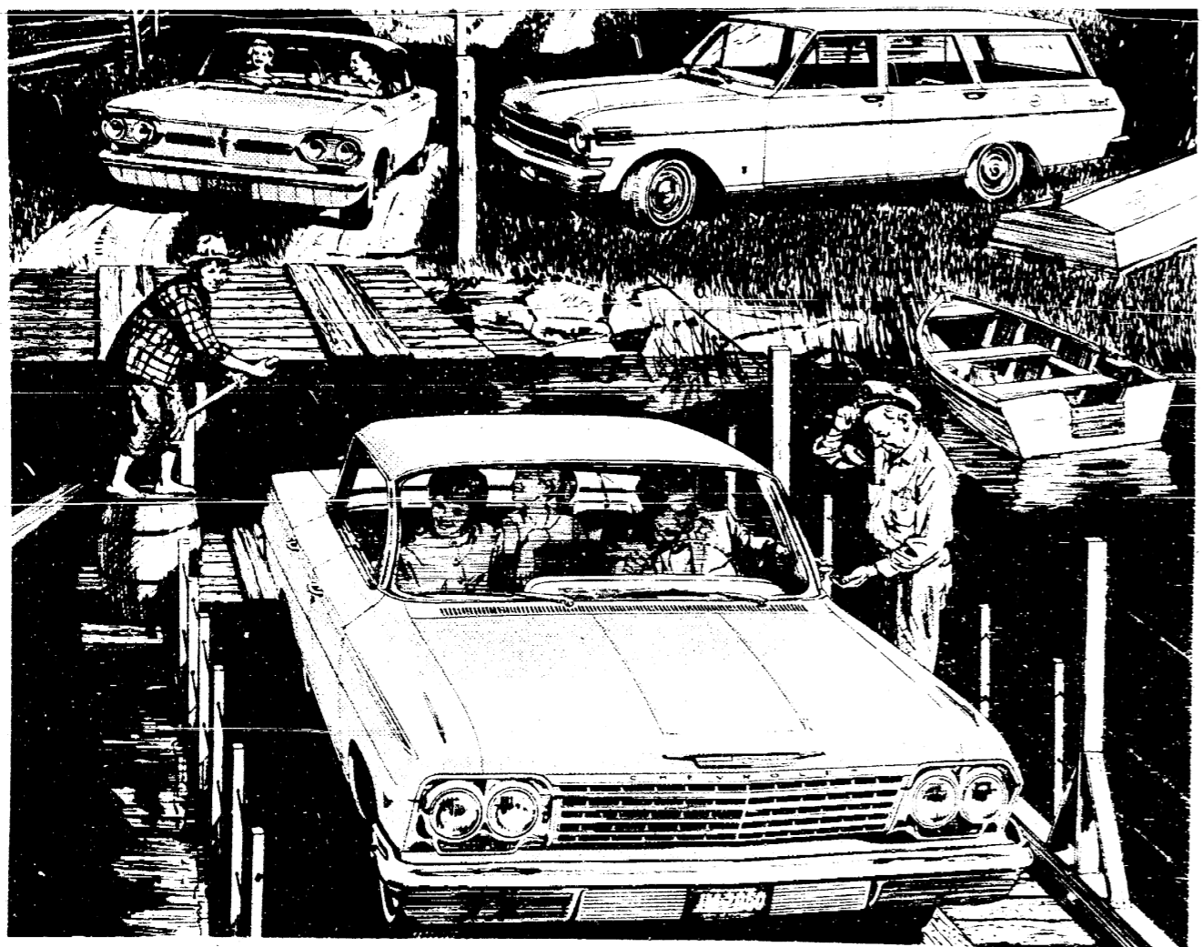
See the new Chevrolet, new Chevy II and new Corvaire at your local authorized Chevrolet dealer's

Corvaire If you spark to sporty things this one ought to fire you up but good. With the engine weight astern, the steering's as responsive as a bicycle's and the traction's ferocious. As for the seat—wow! At the ramp: the Monza Club Coupe.