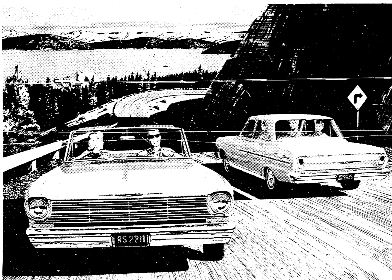
The sporty Chevy II Nova Convertible and sprightly 4-Door Sedan

See the new Chevy II at your local authorized Chevrolet dealer's