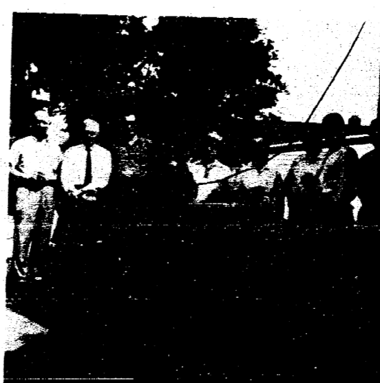
Village Council toasting the new well