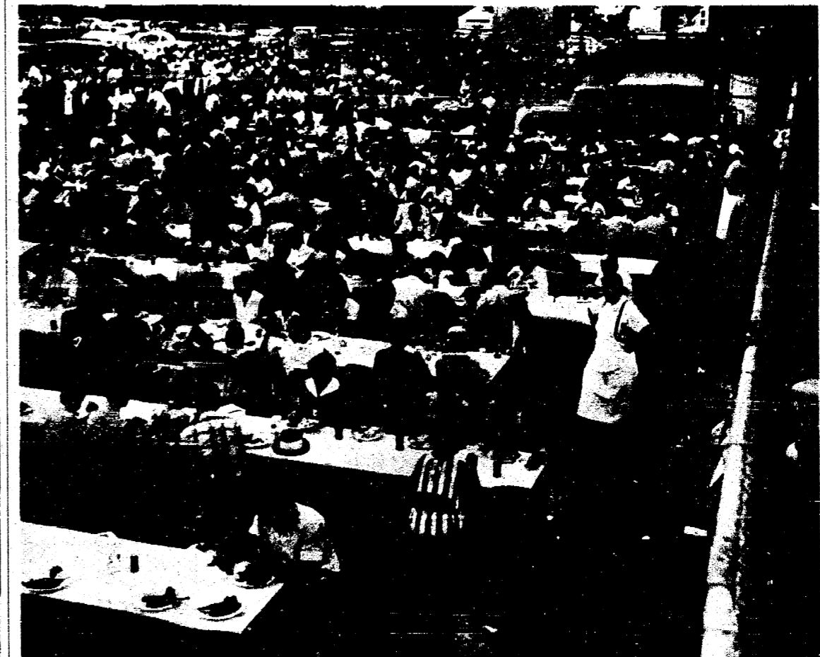
Part of 5000 people served