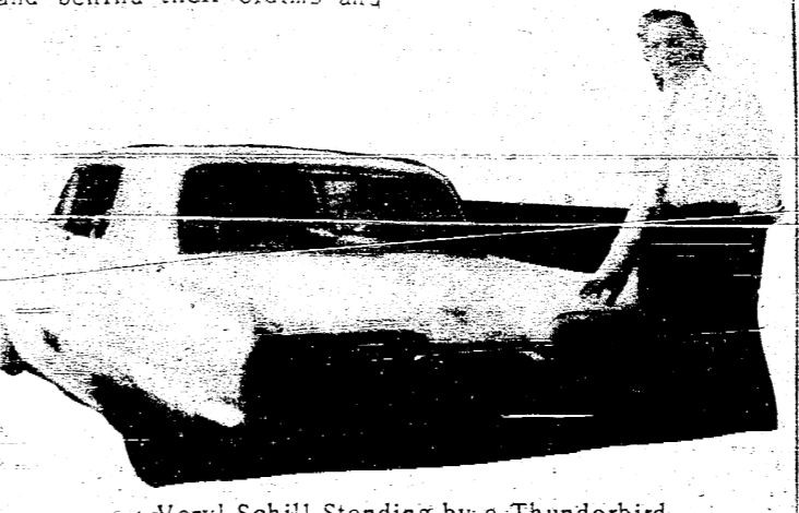
Veryl Schill Standing by a Thunderbird

Schill's Motor Sales, at that will be as happy to meet 12639 Schleiweis Rd. in Man-you after the deal as before the chester, has assisted many the papers are signed. people in solving their car and Schill's Motor Sales call transportation problems, boast many repeat sales and their association with many when auto owners praise the dealers enables them to get great savings and friendly practically any type of auto treatment that they have that you desire. The fact that received from this used car they have established a rep-dealer, it is suffice to state that for fair dealings, is that they deserve the patronage an added assurance of showing anyone who is seeking a car demonstrated and shown used car or who may be considering a trade.