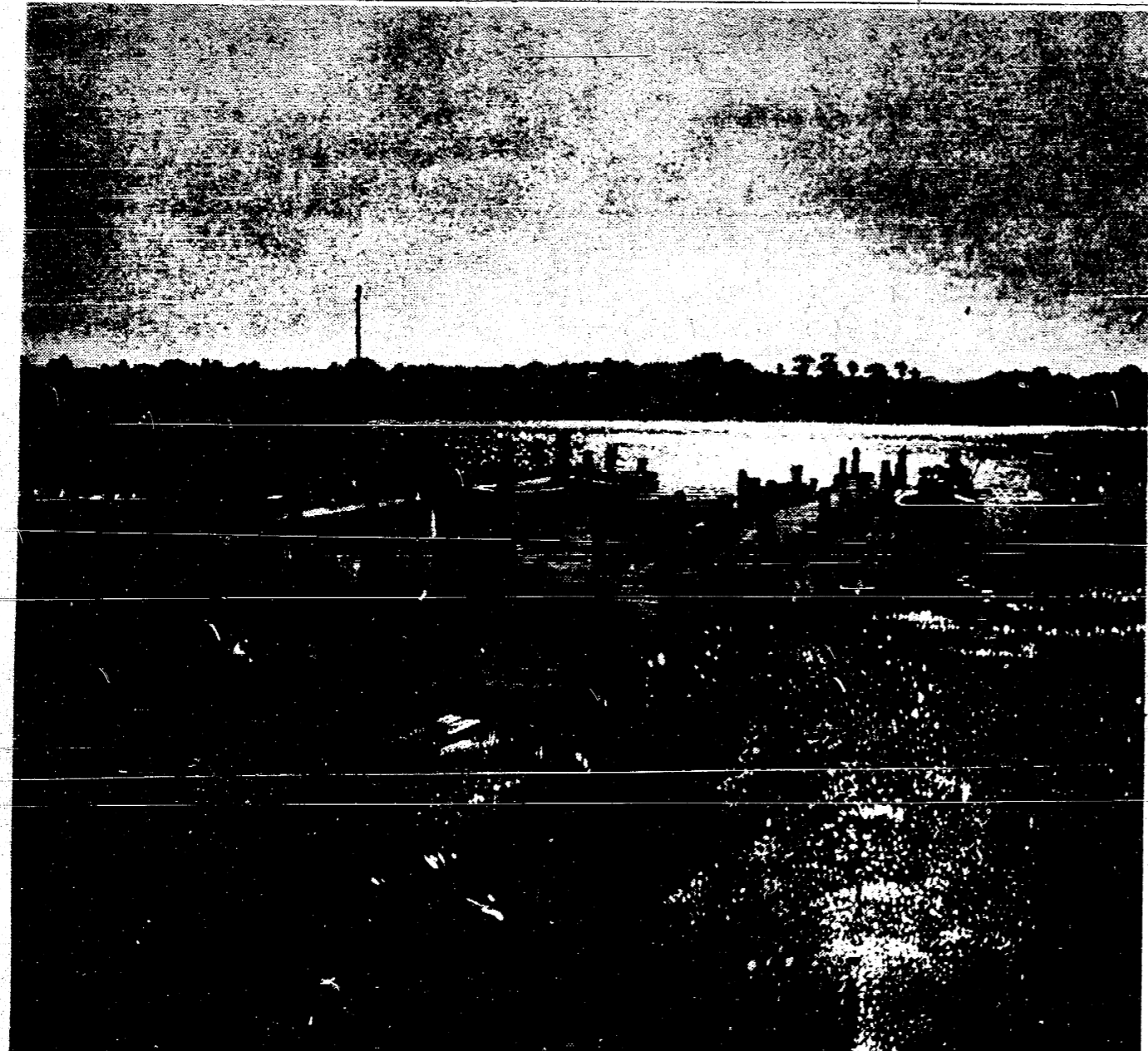
SEPTEMBER SHADOWS—LAKE CHARLEVOIX NEAR IRTON. Free Full Color Reproduction suitable for framing sent upon request.