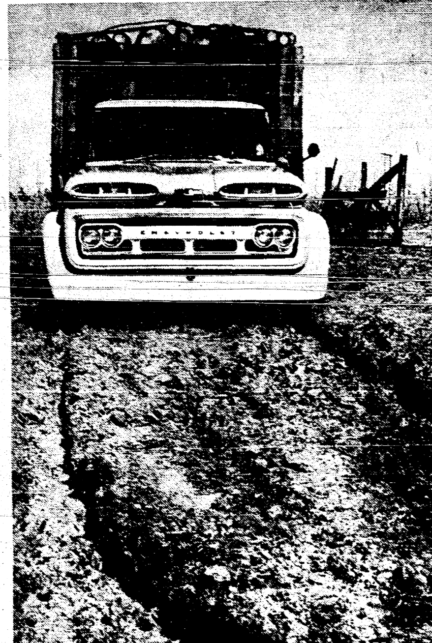
See the Chevy Mystery Show in color Sundays, NBC-TV

"These trails would shake the cab off an ordinary truck...but not our Chevy"