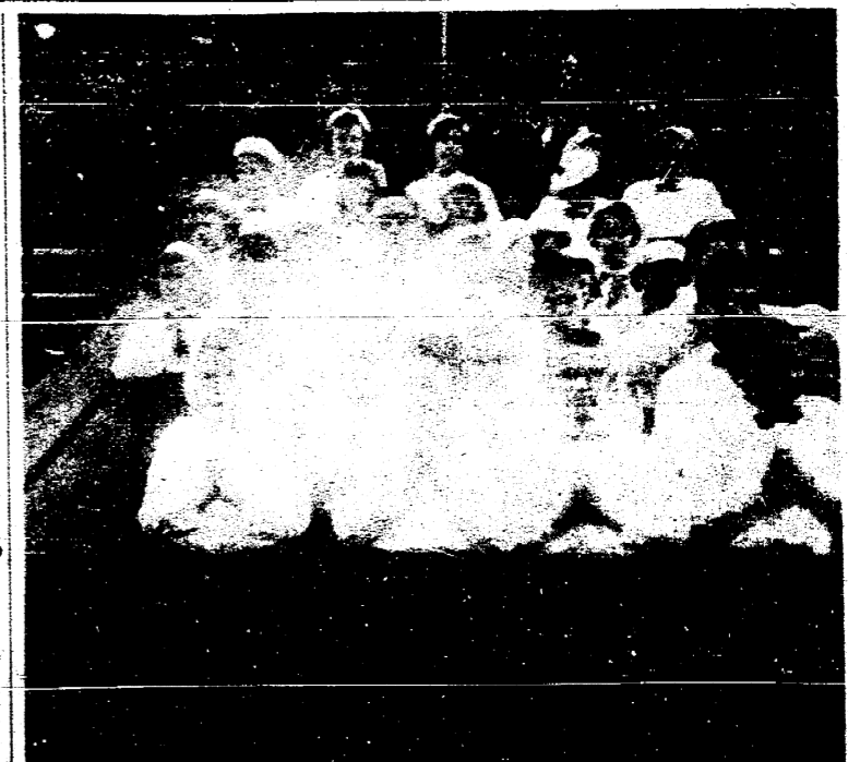
Thirty-two children were confirmed Sunday at St. Mary's by Archbishop John F. Dearden, D.D. The children had been instructed by the Dominican Sisters at Chelsea.