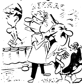
"Any extra charge for trimming ears?"