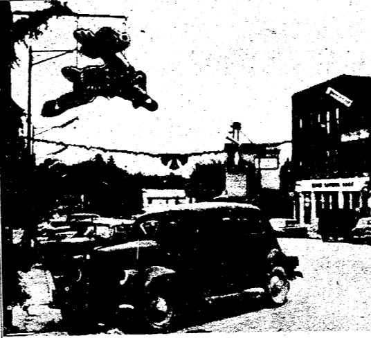
Manchester 'Dressed' for Christmas