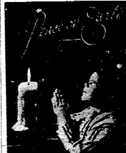
FOR PEACE... A prayer for peace is the theme often repeated at Christmas. This is the time of year when we are all most aware of the need for "peace on Earth" and good will to men.

In Scandinavian families, all shoes are placed together on Christmas day—in the belief that this will cause harmonious living through the coming year. In Ireland, it is traditional that only a woman named Mary snuff the candles on Christmas Eve. In some countries, such as Nova Scotia, it is believed that bad luck will come if the Christmas tree is taken down before the end of New Year's Day.