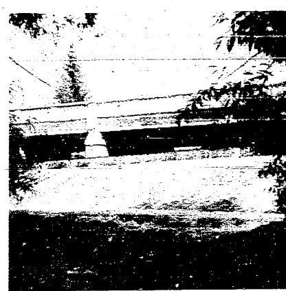
We have always thought that this particular view and scene was one of the prettiest that could be found anywhere. Remember last Thursday morning? How it dawned so bright, clear, and inviting? You do? Then you'll understand how we were prompted to take this particular picture.

The New Post Office building pictured above was built by the Knights of Columbus here and is leased for 10 years with another 10 yr. option available to the Post Office Dept. CUB SCOUT CIRCUS FRIDAY NIGHT AT TER BALL PARK.