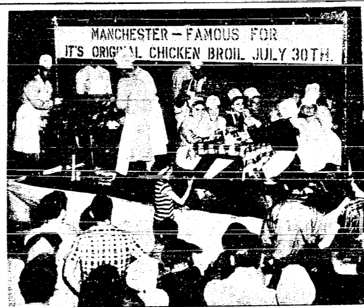
Manchester's Contribution Manchester Jaycees cooked up an advertisement of their annual chicken broil as their float contribution to the state Junior Chamber of Commerce parade in Jackson Friday night.