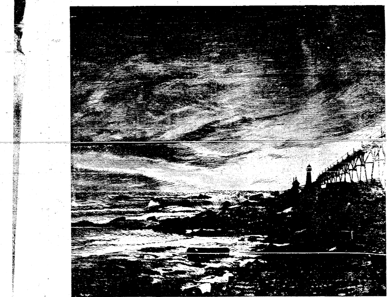
LIGHTHOUSE AT GRAND HAVEN Free Full Color Reproductions suitable for framing and upon request