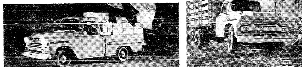
Series 31 Fleetside—round-the-clock delivery specialist!

No job's too tough for a Chevrolet truck!