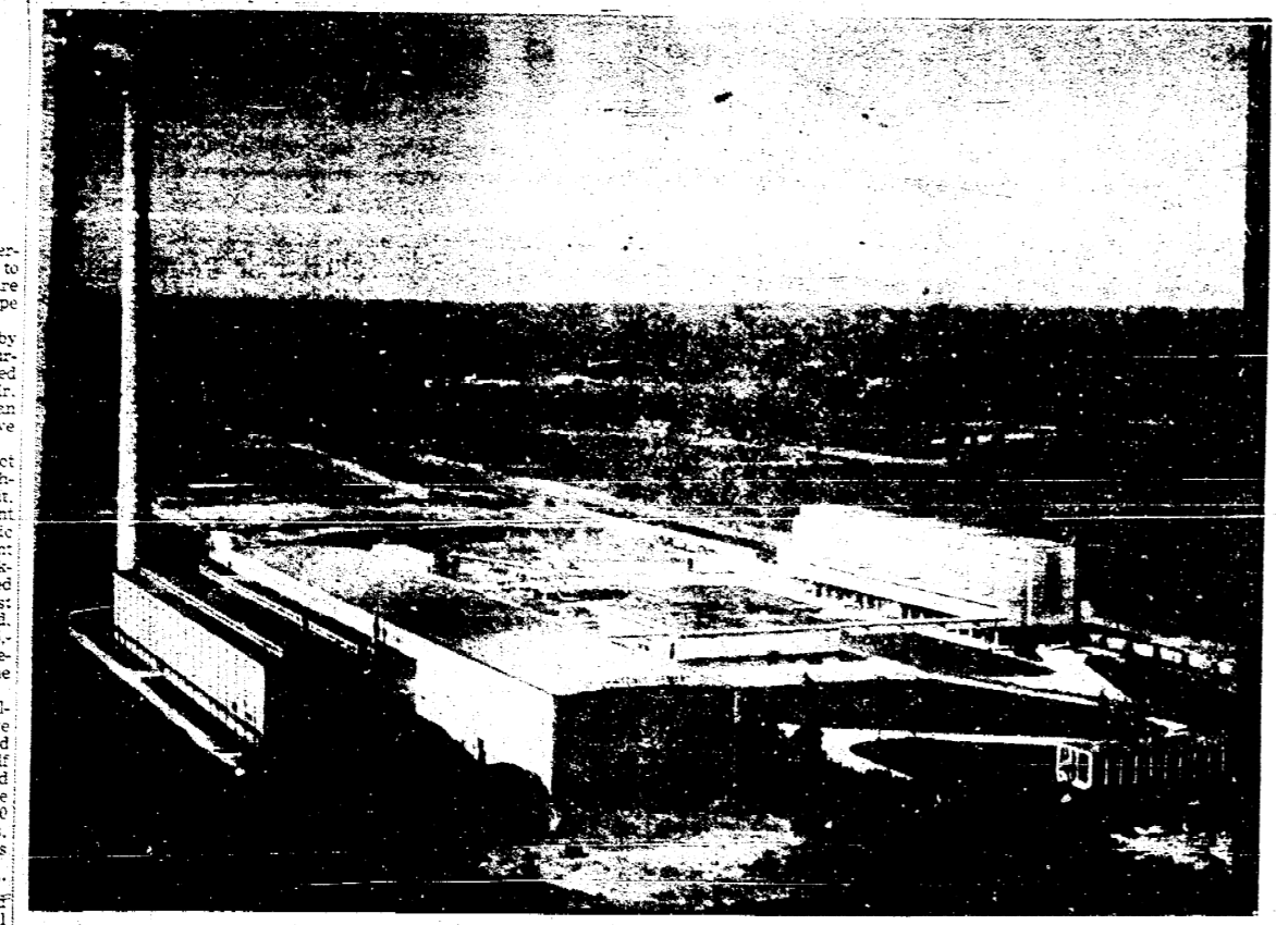
This Cement plant is located in Canada, a similar plant will be started in Dundee.