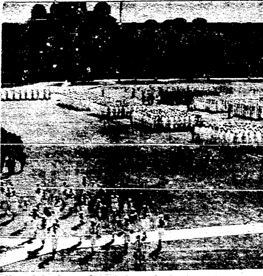
Naval Cadets keep cadence during graduation day at Great Lakes