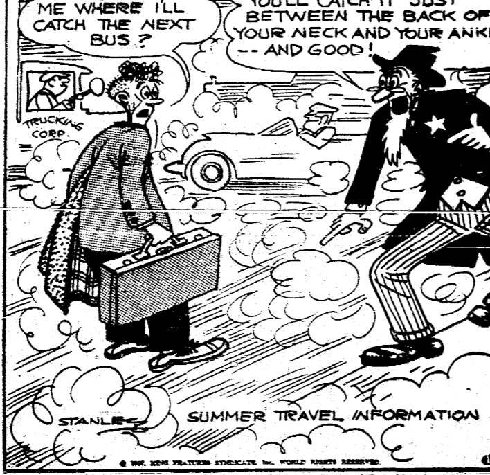
STANLEY'S SUMMER TRAVEL INFORMATION