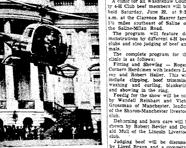
WHILE WHITE HOUSE staff members look on, one of President Eisenhower's two helicopters makes its first practice landing on the lawn of the Executive Mansion.

While White House staff members look on, one of President Eisenhower's two helicopters makes its first practice landing on the lawn of the Executive Mansion.