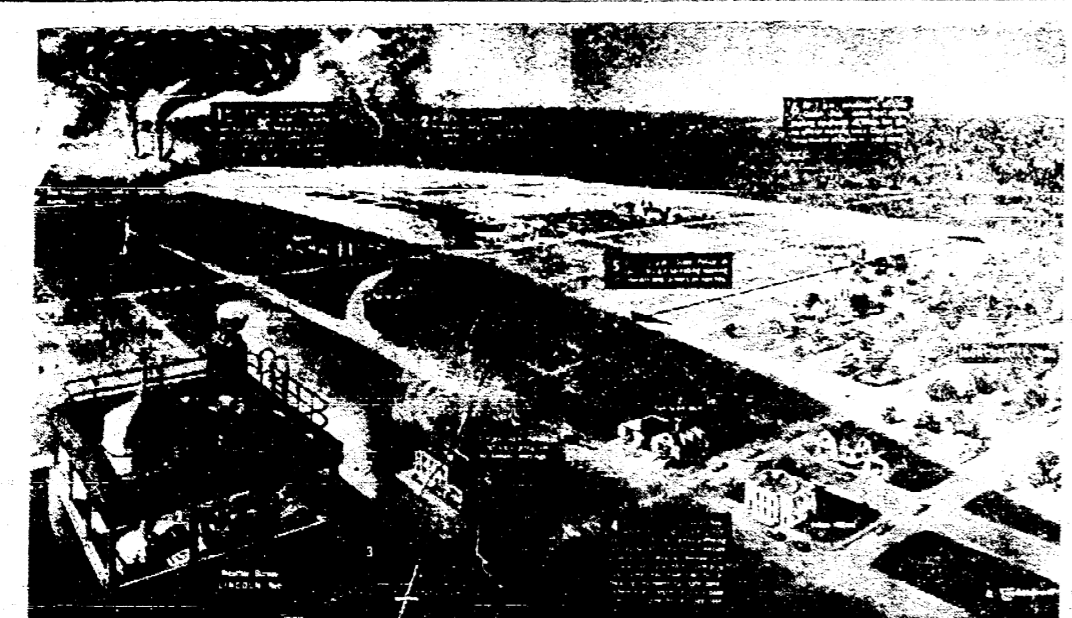
TORNADO WARNING in light can spell the difference between heavy loss of life and... adequate warning could be broadcast to that local area.

Keeping In Touch... Students Plan Annual A. A. Carnival... Take Home CREAMO BREAD A Mighty Complete Food