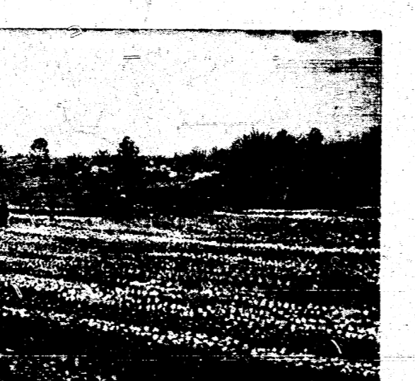
TULIP FESTIVAL, ROLLAND, MICHIGAN

Take Home CREAMO BREAD A Mighty Complete Food... Open Wednesday to 9:00 P.M. Manchester Frozen Food Lockers