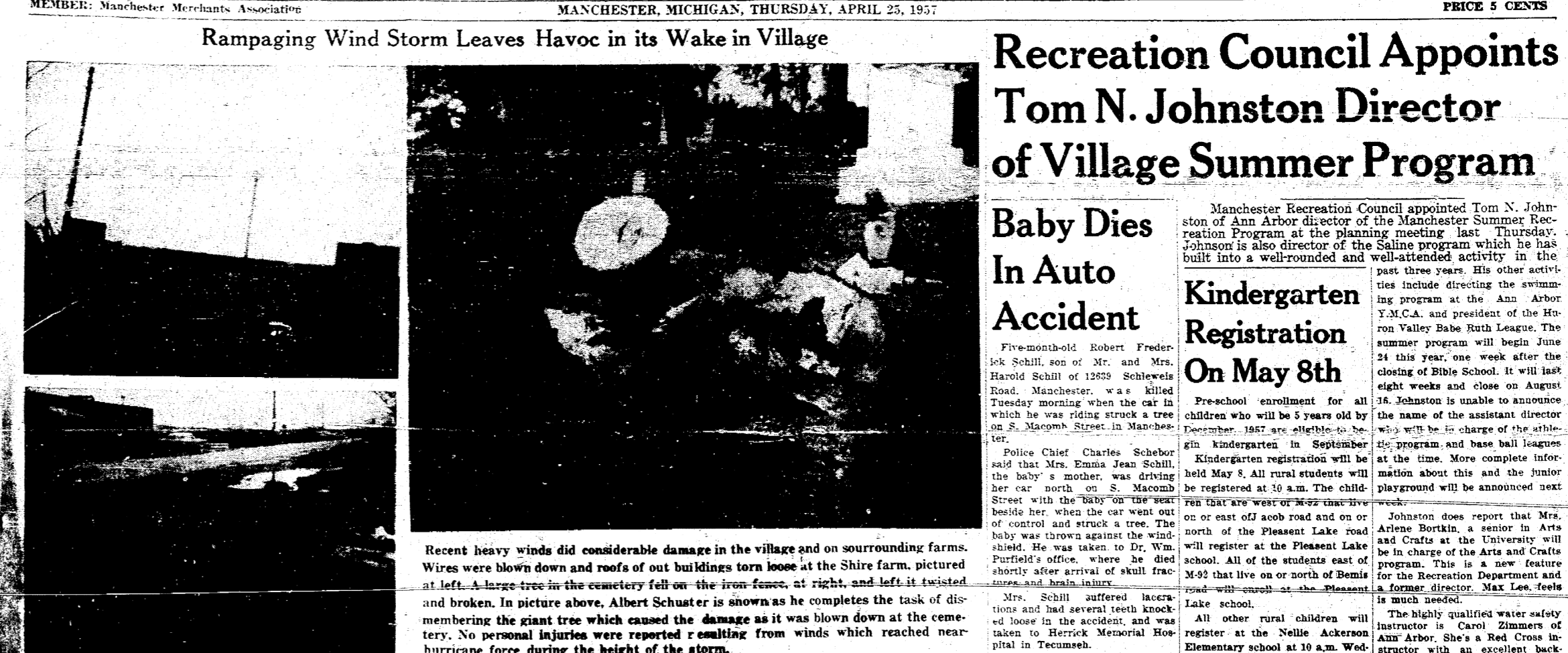
Recent heavy winds did considerable damage in the village and on surrounding farms. Wires were blown down and roofs of out buildings torn loose at the Shire farm, pictured at left...