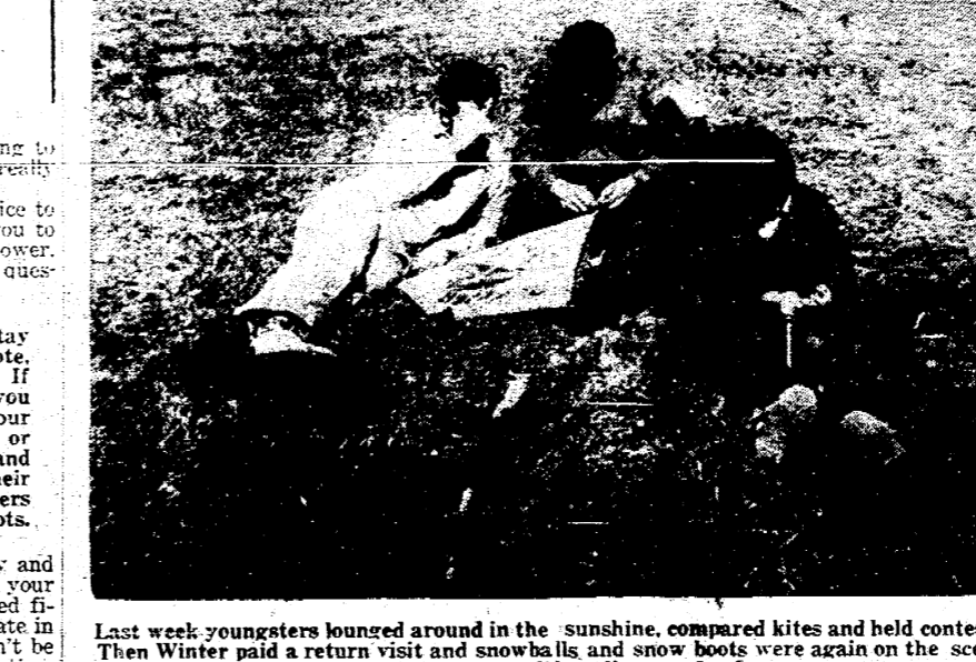
Last week youngsters lunched around in the sunshine, compared kites and held contests. Then winter paid a return visit and snowfalls and snow banks were again on the scene. March just can't decide whether to go out like a lion or a lamb.