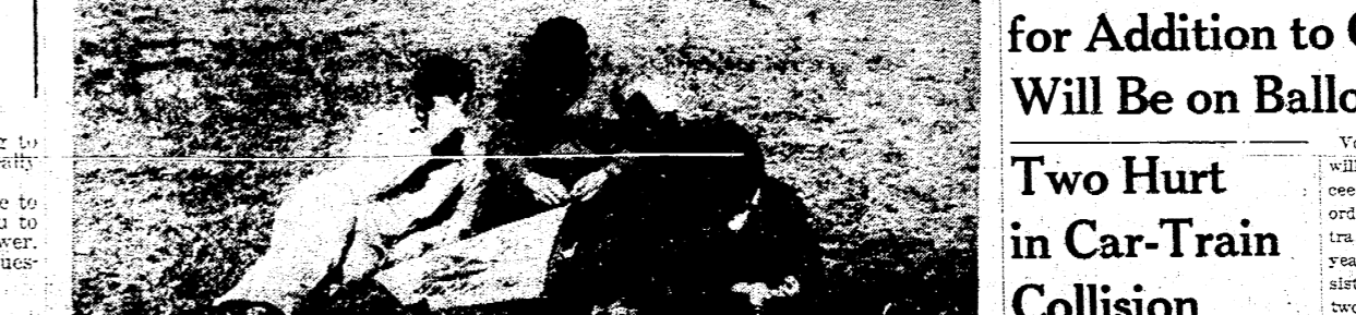
Last week youngsters lunched around in the sunshine, compared kites and held contests. Then winter paid a return visit and snowflakes and snow buns were again on the scene. March just can't decide whether to go out like a lion or a lamb.

Manchester, Michigan, Thursday, March 28, 1957