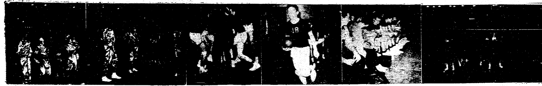
Pre-game warmup chases jitters That opening pitch New start at half Reserves await chance Cheerleaders boost everyone's morale