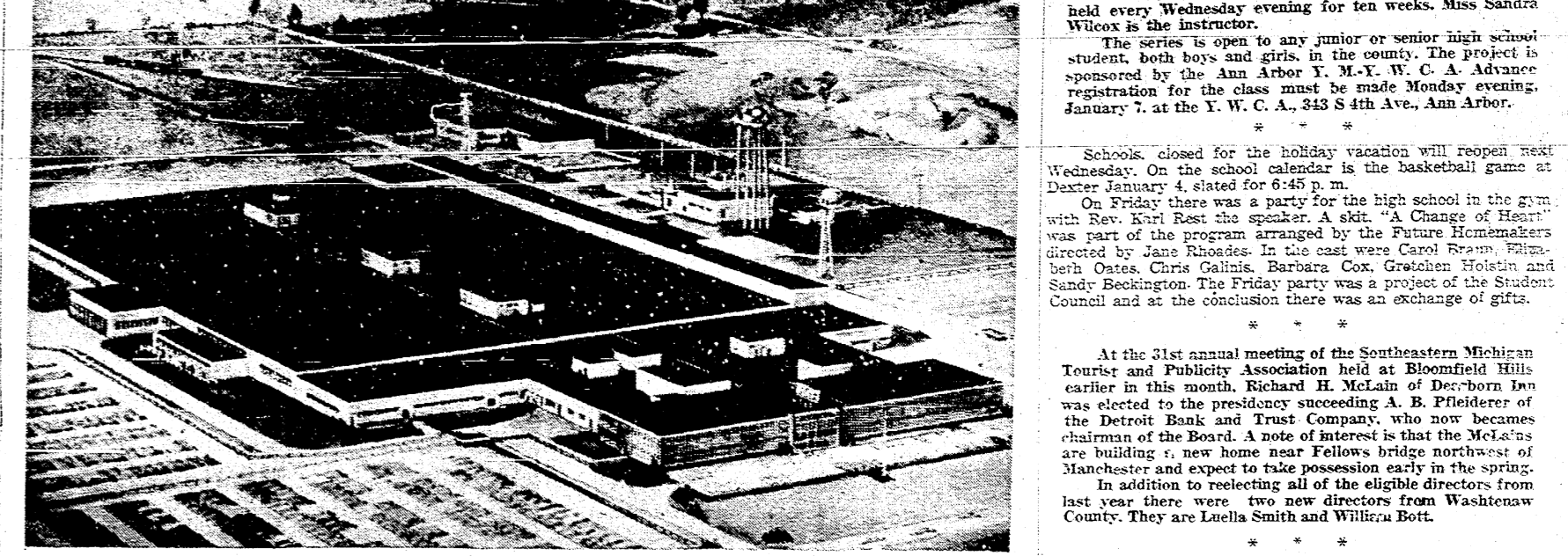
Design details of Ford Motor Company's new Rawsonville plant is being built on a 30-acre site in Woodland Township. The 785,000 square foot of one-story manufacturing space, about half of which is for plant administrative purposes, will be in use by the end of this year. A connecting two-story office building, which now are located at Rawsonville plant is expected to employ more than 3,000 persons.