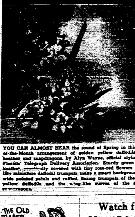
YOU CAN ALMOST HEAR the sound of Spring in this flower-of-the-month arrangement of golden yellow daffodils, French heather and magenta, by Alva Wayne, official stylist for the wide ribbon petals and ruffled, flaring fringes of the daffodils and the wiggly curves of the soft pink pansies.