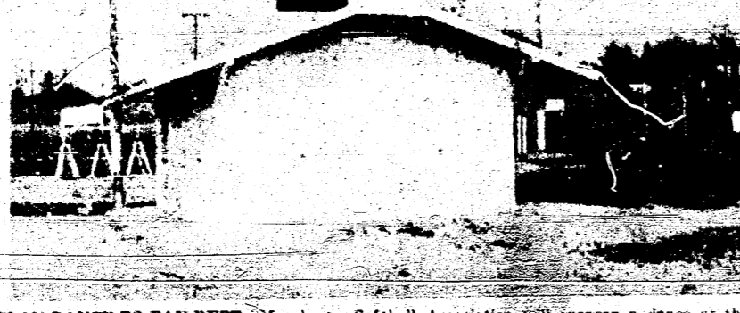
PLAN DANCE TO PAY DEBT. Manchester Softball Association will sponsor a dance at the play auditorium Saturday, October 27 from 8 p. m. to 1 a. m. in an effort to raise money to pay off the debt on the new concrete building on the athletic field. Because many people helped to help with construction work the cost of the building was about $10,000 less than expected. The dance will be held at 2 p. m. on Saturday, October 27 at the play auditorium. The orchestra will furnish music.