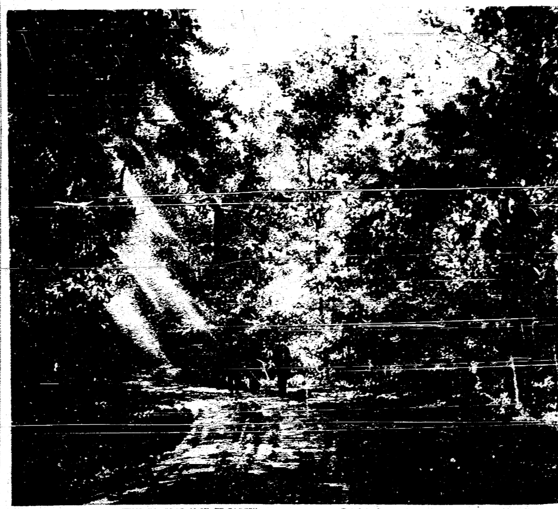
BOW AND ARROW HUNTING IN ALLEGAN STATE FOREST

PLEASE FILL OUT AND MAIL TO "CITIZENS FOR IKE" 364 1/2 S. STATE ST., ANN ARBOR FOR FORWARDING TO WASHINGTON