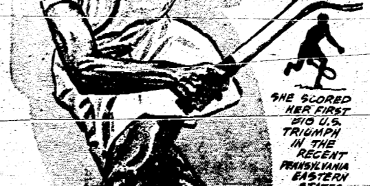
ALTHEA GIBSON, NOW TRYING TO REGAIN SOME OF HER FORMER SUCCESS AT HOME, IS AT THE MOUND.