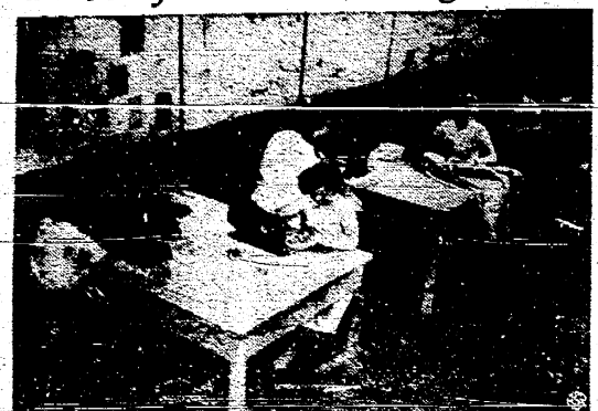
These girls are entered in the Fourth Annual Junior Dressmaking Contest, sponsored by the Singer Sewing Machine Company.

A young lady between 10 and 17 is sewing a dress... The contest is open to girls aged 10 to 17... The winners will receive a Singer Featherweight Portable Sewing Machine.