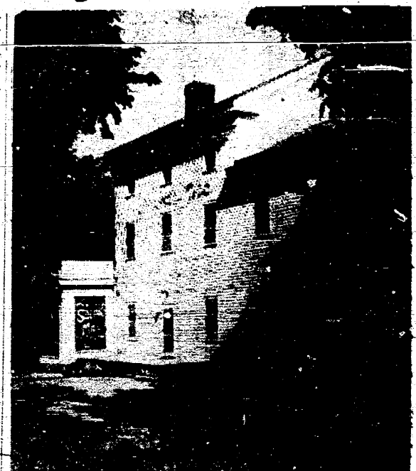
THE OLD MILL AS IT STANDS TODAY . . .

Now in its fourth season (as of 1956), the Saline Mill Theater mounts five major plays during its 10-weeks from late June to ear-