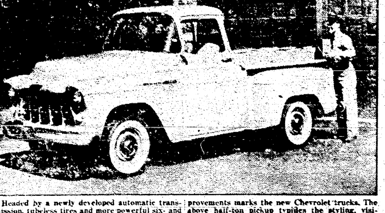
Headed by a new developed automatic transmission, the new Chevrolet trucks, the eight-cylinder engine and more powerful six and above half-ton pickup trucks, the styling, vital, rugged tires, an impressive list of accessories and convenience of the 1936 line.