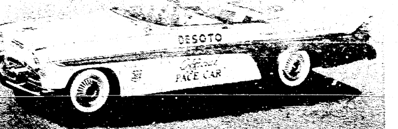
255 hp De Soto to pace Indianapolis "500"

8 A.M. to 6 P.M. Car Washings - Lubrication PHONE GA 8-8331 MINOR REPAIRS