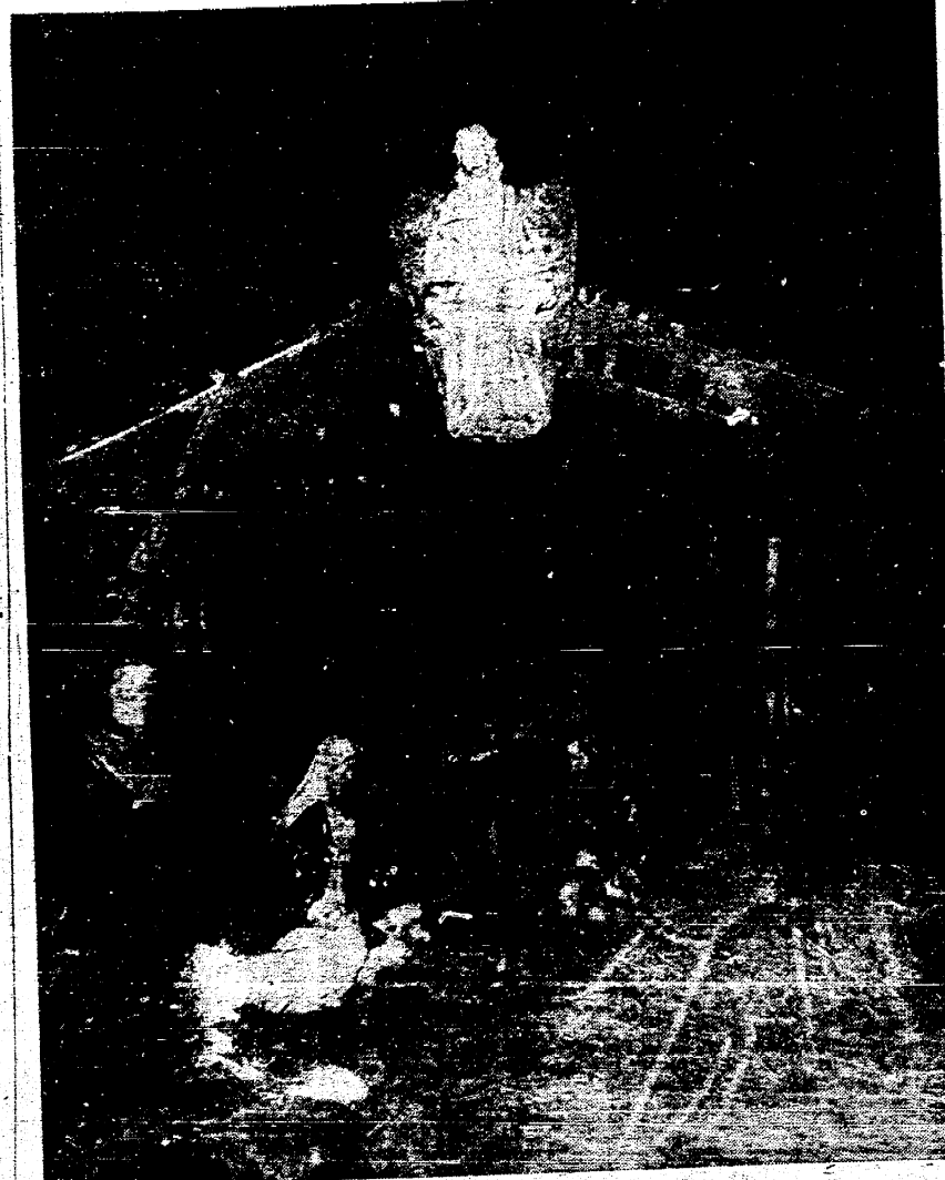
CHRISTMAS DECORATIONS. - The Manger scene above in on the ground of the Emmanuel church, between the church and church hall and has created much interest in the community since it was first put up last year. This year more figures were added until the scene is complete.