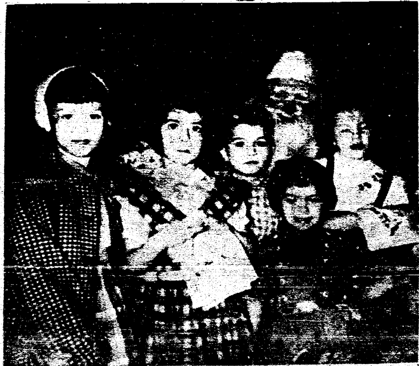
SANTA listened in for a few minutes at the Children's party at St. Mary's to listen to their many requests for everything from dolls to a new car.