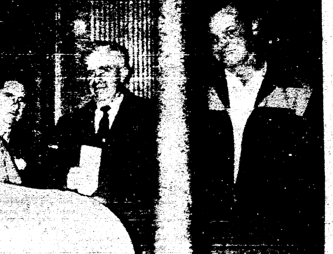
The committee members for the Christmas lights and Santa's arrival.

Christmas lights will be strung on Main Street. Santa is scheduled to arrive on December 17. There will be holiday parties planned for the community.