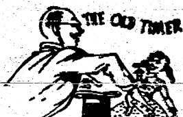
"It takes a magician to put the rabbit out of the hat—but anyone can let the cat out of the bag!"