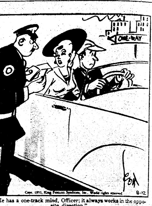
He has a one-track mind. Officer; it always works in the opposite direction.

Payment in money to prisoners in jails was advocated at another U.N. offshoot meeting. The committee on 'Prevention of Crime and Treatment of Prisoners' convened recently in beautiful Geneva.