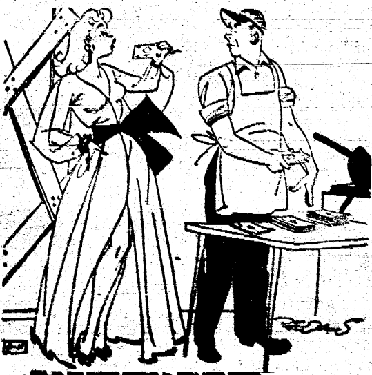
Miss. during why don't you put MY picture on the suit back?