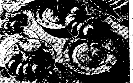
SHRIMP COCKTAILS - FESTIVE AND INEXPENSIVE

Shrimp is on the U. S. Government's Plistical List. Prices are down; supplies are high. That's welcome news for Americans, who consider shrimp their favorite shellfish. Now the shrimp is frozen and shipped throughout the country, that's no reason why all of us can't take advantage of this delicious seafood, especially when shrimps' catches are abundant. One of the most popular shrimp dishes is a cocktail. It's easy to see why. Besides being delicious, a shrimp cocktail is one of the most appealing first courses - plain shellfish on a bed of crisp greenery.