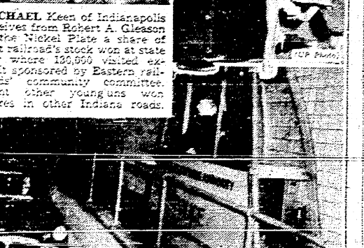
TUNNEL TROLLEY... the... of the... of the... of the...