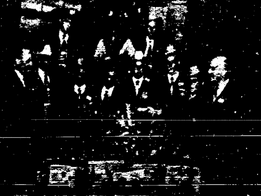
PORT ROOPER... show in Chicago... the... of the... of the...