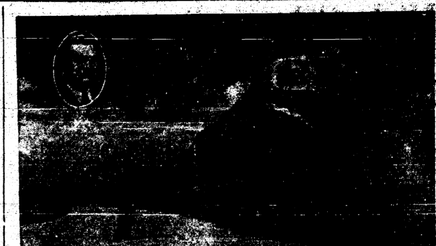
ORDERED FOR ECONOMY. A fleet of 17 new general purpose diesel locomotives has been added to the rolling stock of the Grand Trunk Western, a subsidiary of the Canadian National Railway, as part of the railroad's program to reduce operating expenses. Donald Gordon (seated), chairman and president of the system, said, "Diesel locomotives in use on lines in Canada and the United States have already reduced operating expenses by about $5,000,000. By 1957 this may well reach $10,000,000 and represent a saving of about $4,000,000 a year, or a 20 per cent return on the investment in equipment."