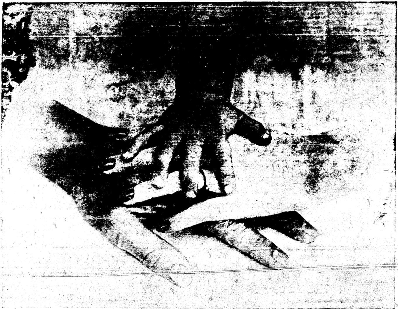
Together—with Faith—you'll build a richer life.