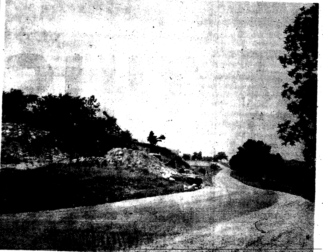
STRAIGHTENING MANCHESTER-CHELSEA RD: County road commission men and machinery are gouging out a kink in the highway one mile north of Manchester to reduce a traffic hazard. They are also removing a bit of scenic charm in the process.